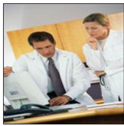
We hold your records in STRICT CONFIDENCE